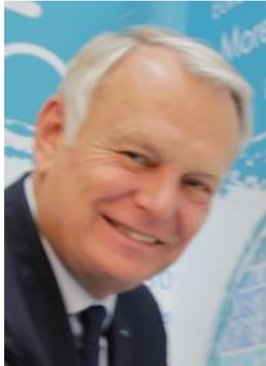
Jean-Marc Ayrault, Député of Loire Atlantique, former French Prime Minister (2012/2014), former Mayor of Nantes (1989/2012)

Jump on a plane at City Airport and go and see for yourself.